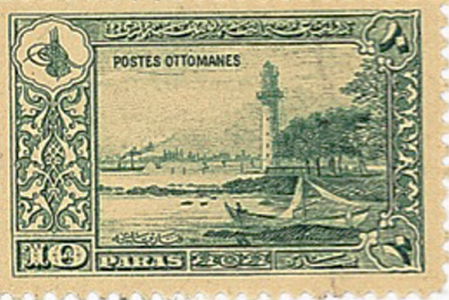
Fig. 11a-c. a) and b) Ottoman postage stamps depicting Fenerbahçe, lighthouse of Istanbul, issues of 1914 and revised post-Genocide issue of 1920; c) (above) the line in cryptic Armenian in the 1914 version reading "mankind will worship God". Istanbul, Orlando Carlo Calumeno Collection, courtesy of Osman Köker.

Far East, as presentation items for churches such as Holy Etchmiadzin and the Patriarchate of Jerusalem and that of Constantinople. Armenian altar curtains have not yet been thoroughly studied as a group,<sup>37</sup> but their often lavish decorations and very elaborate inscriptions make them immediately recognizable. The largest collections are at Holy Etchmiadzin and the Armenian Patriarchate of Jerusalem, including one with lavish paintings of the trees and bushes of south India labelled in Armenian and a local Indian language (Fig. 10a-b).<sup>38</sup> Though they were manufactured by Indian craftsmen on the Coromondel Coast, their iconography and the "cartons" used for their execution were almost certainly the work of Armenians.