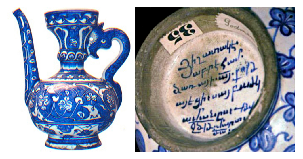
Fig. 2a-b. Liturgical pitcher, inscribed in Armenian and dated 1510 on its base crafted in the Armenian-Ottoman ceramic centre of Kütahya. British Museum, formerly in the Godman Collection

The oldest dated Armenian ceramics are a liturgical pitcher of 1510 (Fig. 2a-b) and a bottle of 1529 (Fig. 3a-b) both manufactured in the western Anatolian town of Kütahya.<sup>6</sup> The blue and white pitcher and bottle are incidentally the oldest dated ceramics to be produced within the Ottoman Empire. Kütahya was most famous for the massive series of more than 10,000 tiles and objects produced there in 1719-21, which now decorates the Armenian Cathedral and Patriarchate of St. James in Jerusalem. At least from the fourteenth century until the Armenian Genocide of 1915, the illustrious ceramic industry of Kütahya was dominated entirely by Armenians.<sup>7</sup> Among the patrons of the ceramics created for Jerusalem was Abraham Vardapet, whose monogram (Fig. 4b) was fashioned on a number of Kütahya pieces, like the dish of 1719 showing the beheading of St. John the Baptist (Fig.