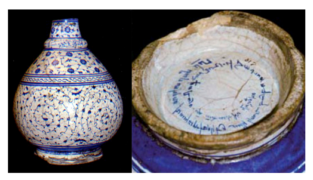
Fig. 3a-b. Liturgical bottle, inscribed in Armenian and dated 1529 on both the base and the upper ring, crafted in the Armenian-Ottoman ceramic centre of Kütahya. British Museum, formerly in the Godman Collection