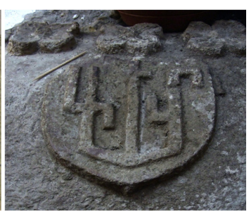
Fig. 8a-c. Three Armenian monograms of the seventeenth century in stucco and stone from houses in Zamość and Lwow: