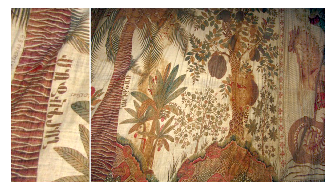
Fig. 10a-b. a) Armenian altar curtain, stamped and painted in 1798 in Madras, India, with the principal motif made up of exotic trees and bushes from southern India with legends in both Armenian and the local India language, with a mounted St. George to the left (not visible), b) detail showing the coconut palm with the Armenian inscription "narglitzar", coconut palm, from the Arabic nargil and Armenian tzar, tree. Jerusalem, Armenian Patriarchate, Church of St. T'oros

There are of course hundreds if not thousands of textiles with Armenian inscriptions created in diasporan communities: embroidered and woven textiles, liturgical garments, lace of various types, chalice clothes, and even large altar curtains.<sup>35</sup> The most impressive group of the latter is a series of stamped and painted cotton curtains with traditional scenes from the history of the Armenian Church manufactured in southern India around Madras.<sup>36</sup> These date from the late seventeenth through to the eighteenth century. They were commissioned by rich Armenian merchants, most of them native of New Julfa trading in the