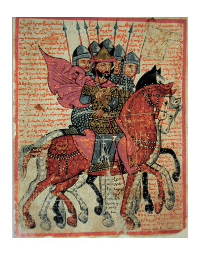
Alexander mounted on Bucephalus advance against the Bebrycians, Alexander Romance, ca. 1300–1325, Venice, San Lazzaro, Mekhitarist Library, V424, fol. 101v