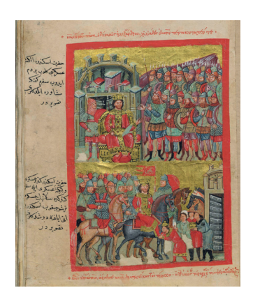
Alexander counts his troops and below mounted on Bucephalus he enters Thessalonica, Romance , mid-14<sup>th</sup> century, Venice, Hellenic Institute, fol. 36v.