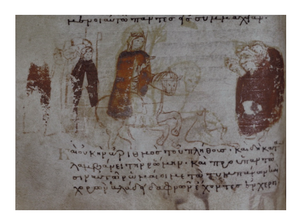
Alexander enters Rome riding Bucephalus, Alexander Romance, Byzantine, early 13<sup>th</sup> century, Oxford, Bodleian, Barocci 17, fol. 28