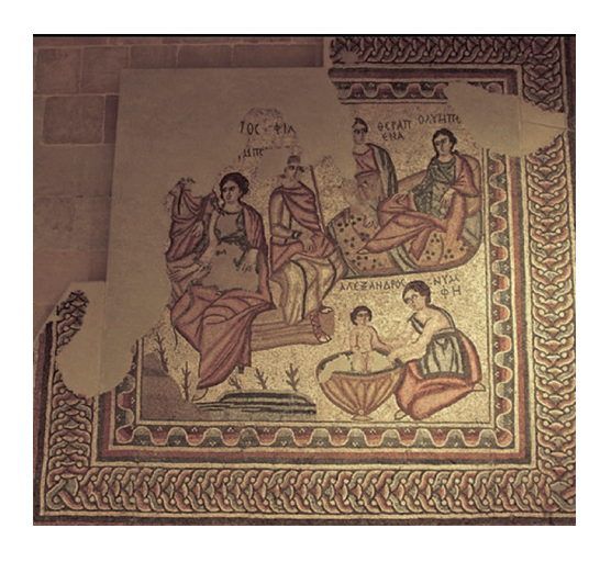
Mosaic found in a villa at Soueidié near Baalbek showing the birth of Alexander and fragments of other scenes from the PseudoCallisthenes, 4<sup>th</sup>–5<sup>th</sup> century, Beirut, National Museum